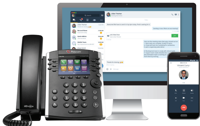
8x8 Virtual Office